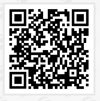
CERTIFICATE NUMBER 73057