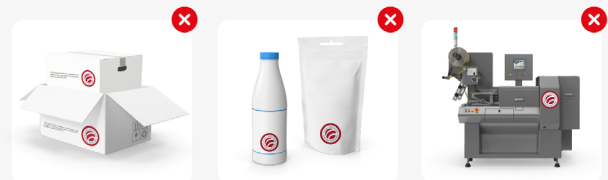
Packing and packaging

This includes: Labels, Packaging, Wrapping, Quality or product certificates, calibration test results, test results of equipment calibrations, on the product.